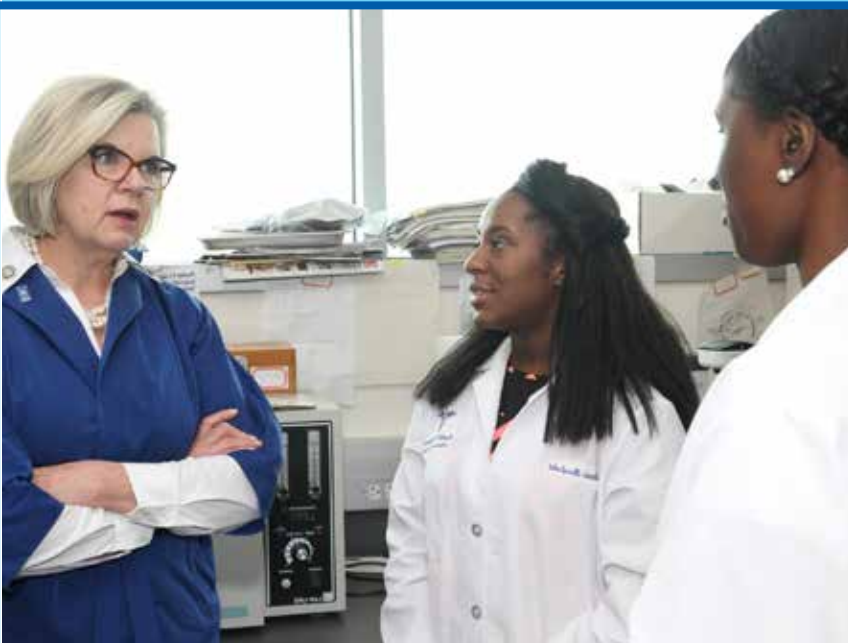
UNC President Margaret Spellings talks to students.

the kinds of bacteria that are associated with those individual microscopic nematodes. With this, he investigates if these microscopic animals are selective in their association, either as food or in permanent partnership with microbes and how these associations impact nutrient cycling in nature. As the two groups are most diverse and numerous in sediment, the implication of understanding how the interaction works cannot be overemphasized.