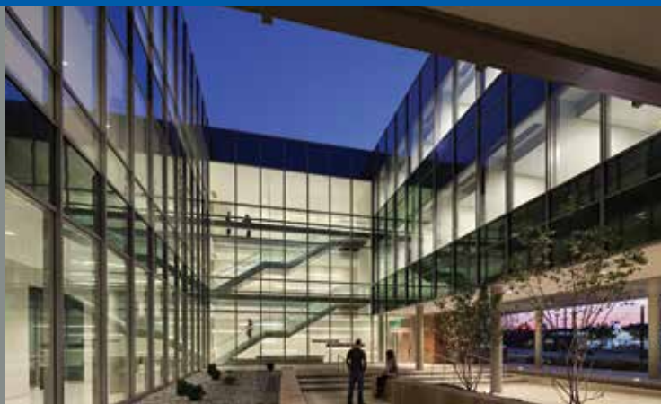
Willie and Jacqueline Gilchrist Education and Psychology Complex

MISSION STATEMENT: Elizabeth City State University (ECSU) offers baccalaureate, professional, and master's degrees for a diverse student body. Our mission is to promote economic, social, and environmental progress for the people of northeastern North Carolina, the state, and the nation. We achieve our commitment to the highest quality education by maintaining a rigorous focus on academic excellence through liberal arts programs and using innovative and flexible technology-based instruction models to enhance our signature areas: integrating technology with education, improving human health and wellness, and advancing the natural and aviation sciences.